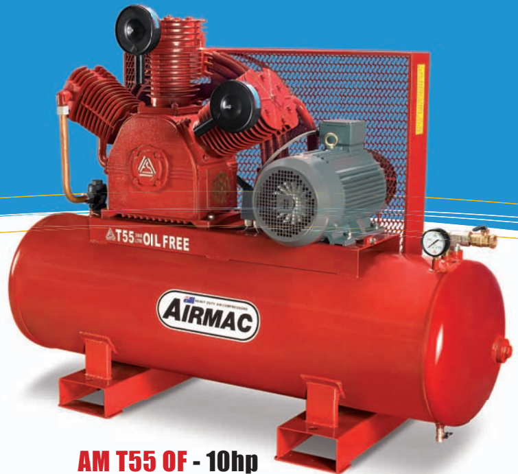
AM T55 OF - 10hp

100% oil free compressors for use in specialised industrial applications such as breathing air, food processing, pharmaceutical production and precision painting systems.