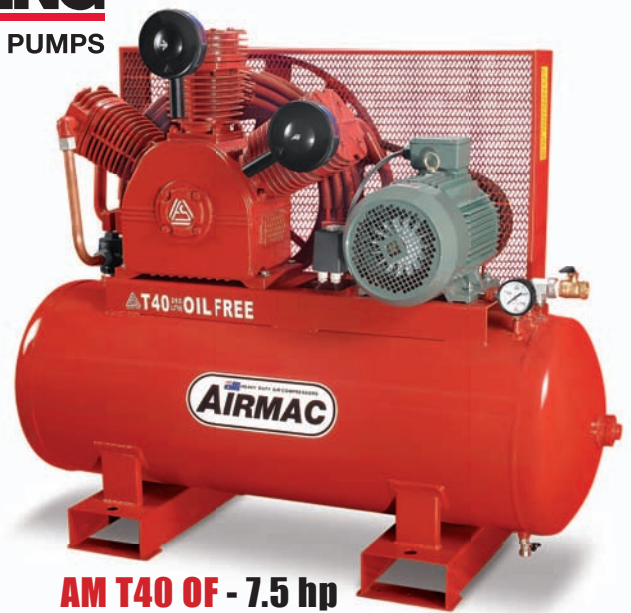
AM T40 OF - 7.5 hp